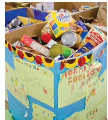
Food donations to Second Harvest