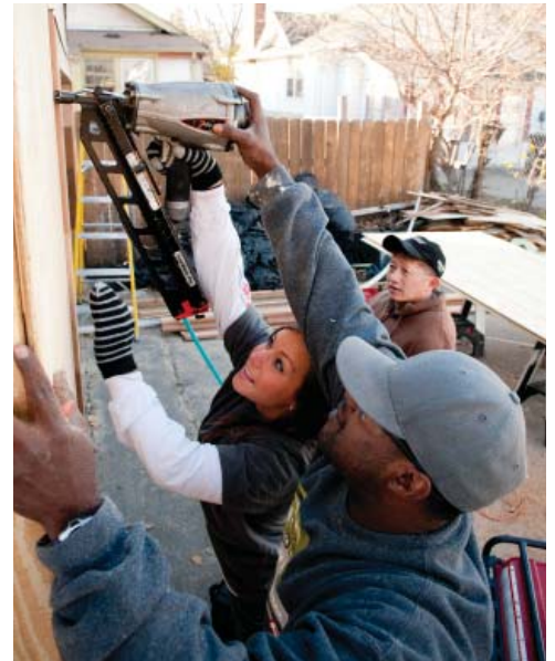
Urban Homeworks volunteers repair a home on the Northside.