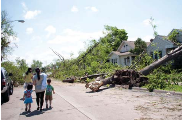
A family walks by downed trees the day after the storm.

The Minneapolis Foundation, Greater Twin Cities United Way, and GiveMN launched the Minnesota Helps - North Minneapolis Recovery Fund on Monday May 23. The Fund was created to support the immediate and long-term needs of the individuals, families, nonprofits, and businesses impacted by the devastating tornado and storm that hit North Minneapolis on May 22, 2011.