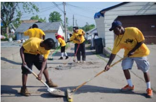
EMERGE volunteers help clean up the Northside.

Thousands of children and youth participated in summer enrichment activities throughout the summer through the Boys and Girls Clubs of the Twin Cities, North Community YMCA, EMERGE Community Development, Minneapolis Park and Recreation Board, YWCA of Minneapolis, and Tree Trust. Much of the funding supported the expansion of existing programs by providing additional scholarships and extending programming throughout the summer to those impacted by the tornado.